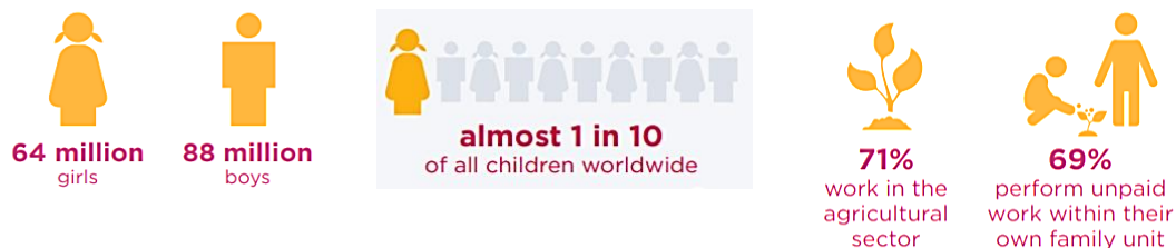
Figure 2. Worldwide: absolute numbers of children in child labour; number of children working per 10; and percentage of children working in the agricultural sector and percentage of children in unpaid family work. Source: ILO, 2018.

All the above-mentioned organizations fear that the gains made in reducing child labour may be reversed. Such a situation would be the consequence of different factors closely related to the