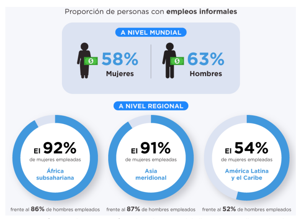
Figure 1. Proportion of men and women in informal employment: globally; and regionally in Sub-Saharan Africa, South Asia, and Latin America and the Caribbean

One inequality that is highlighted in this report is that related to informal employment. In this aspect, although globally the proportion of men who have this type of work is greater than that of women, this trend is the opposite in certain regions. As shown in Figure 1, both in Sub-Saharan Africa, South Asia and Latin America and the Caribbean, the percentage of women working in the informal sector is higher than that of men (UN Women, 2020).